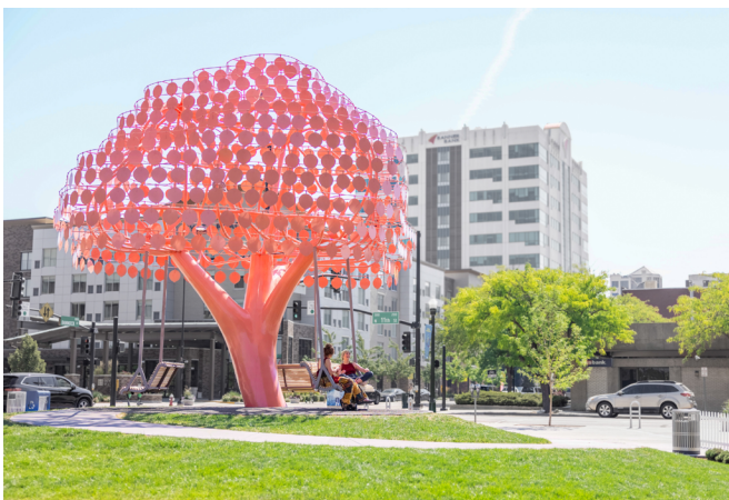
Gentle Breeze by Matthew Mazzotta, 2021 Boise, ID

Landmark projects will mark entrances to Placer One and transitions between neighborhoods and different types of places within the community. They will be located at important crossroads and will serve as gateways, welcoming people and guiding residents and visitors through the community. Landmark projects are recommended for the Welcome Center, University Village Drive and Town Center Lane, and/or other key entrances. Also included in this category are smaller scale landmarks in the form of a series of artworks to be incorporated into the monument markers at entrances to the Villages.