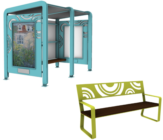
Placer One Transit Shelter and Backed Bench Renderings from the Placer One Street Scape Furnishings, By Graham Projects