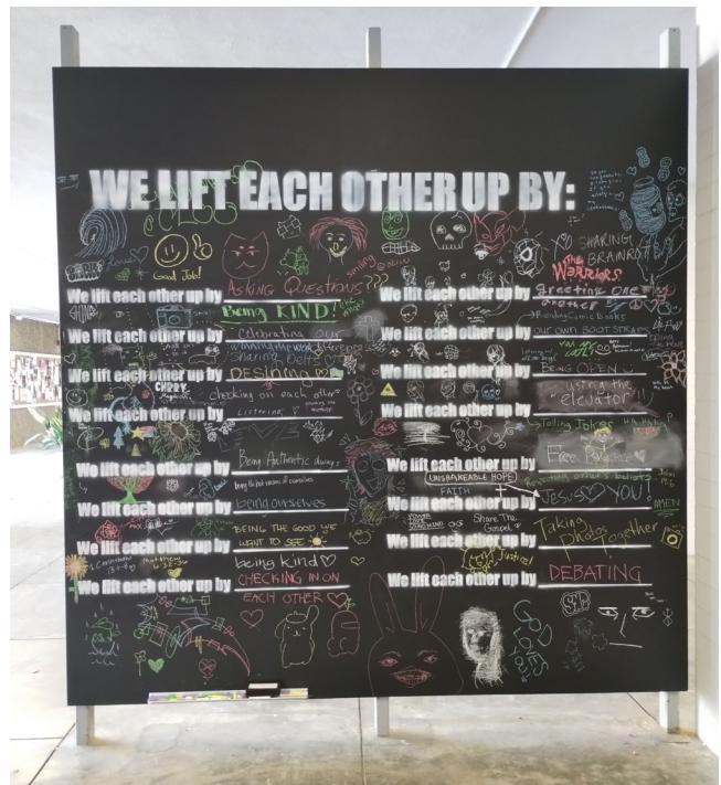
"We Lift Each Other Up By" Interactive art at Sacramento State University