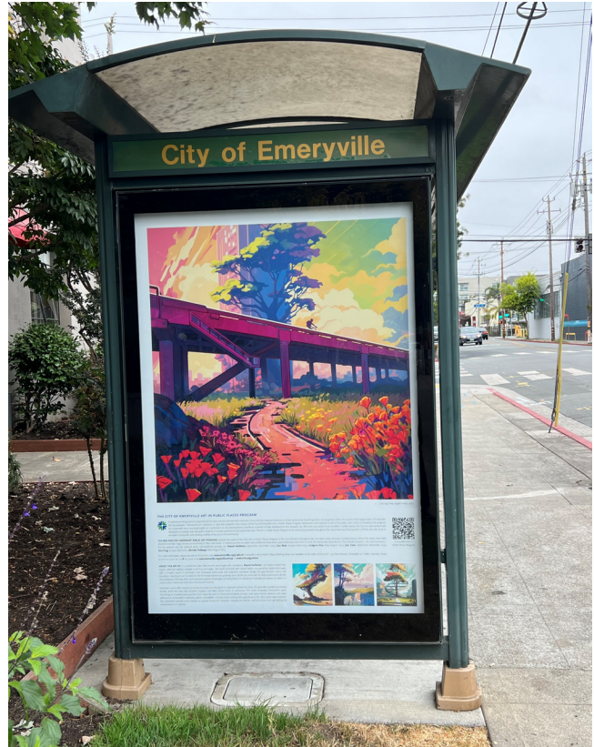
Naomi van Doren, 2023, Emeryville Art in Public Places Program

Finally, the Plan recommends that special consideration be given to planning for public art and artistic infrastructure in the Town Center and in future parks throughout Placer One. Before the design of the Town Center begins, Taylor Builders should consider hiring a public art consultant to develop an area specific plan that will identify the best locations and opportunities for publicly accessible art and artistic infrastructure and public art programming in the Town Center. As part of this planning effort, Taylor Builders can encourage future builders and businesses to support and participate in the growth of the Art Initiative. A Town Center area specific plan should contemplate developing design guidelines that include requirements for publicly accessible art in spaces that are publicly owned as well as privately owned. Similarly, early in the design process for future parks in Placer One, Taylor Builders should hire a public art consultant to work as a part of the design team to identify the best public art opportunities in each park.