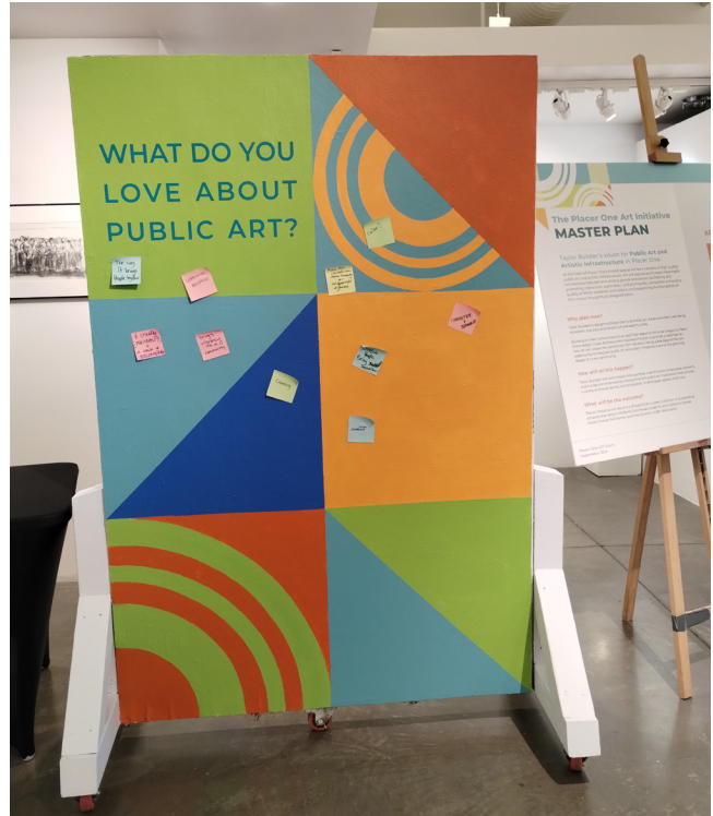
"What do You Love About Public Art?" Community engagement mural for Placer One stakeholder event, 2024, By Graham Projects

As the Placer One Art collection grows, the Art Initiative will need to keep accurate and current records about each artwork and maintain and conserve artworks to ensure they remain community assets. The plan provides best practices regarding routine maintenance and conservation, as well as recommendations for how to handle deaccessioning artwork, when needed.